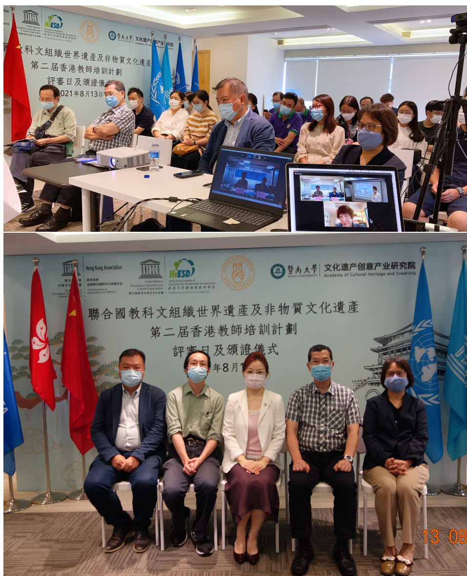
Photo 4: Group photo by the Executive President and judges during the report & judging day