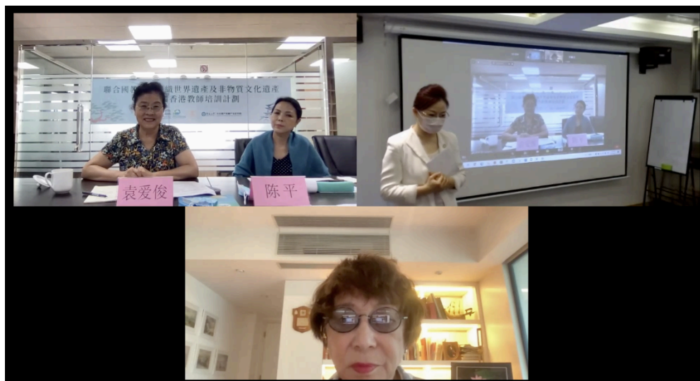
Photo 5: Online summary from the representatives of the organizers